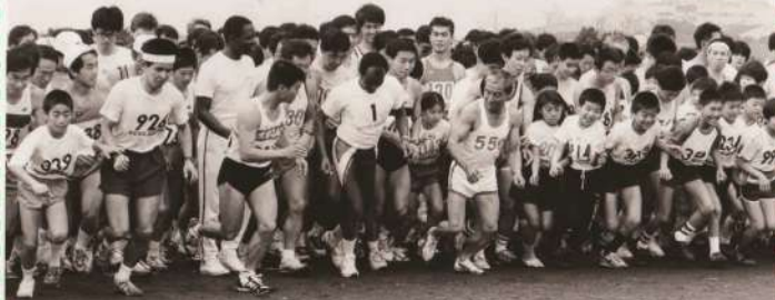
Monthly Kawasaki Marathon has a long history, more than 40 years.....